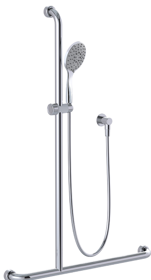
Drawn LH (Left Hand)